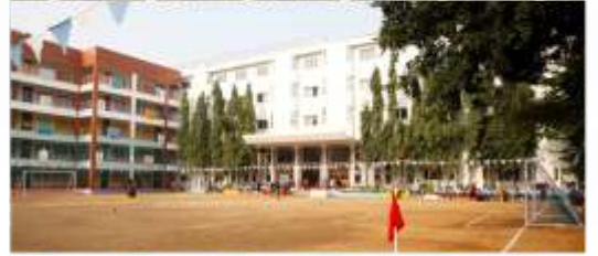
National Academy for learning (NAFL)