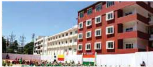
National Public School, Rajajinagar