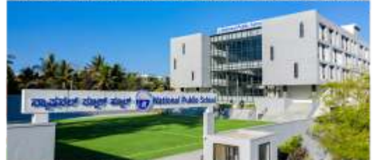
National Public School, JP Nagar