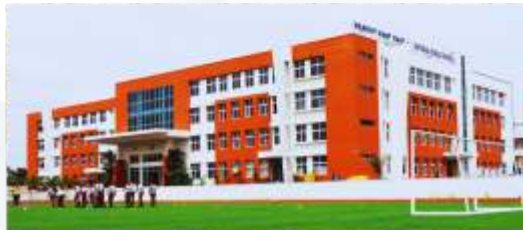
National Public School, Varthur