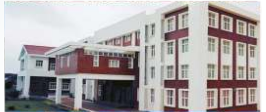
National Public School, Koramangala