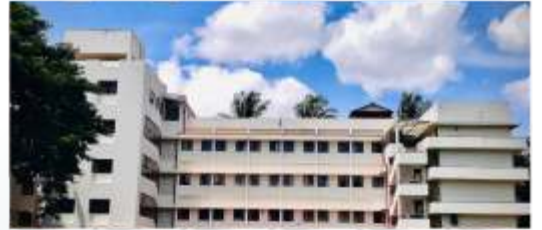
National Public School, Indiranagar