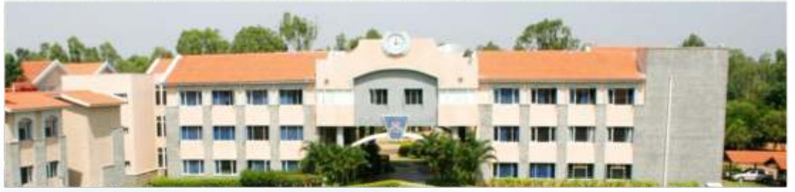
The International School, Bangalore (TISB)