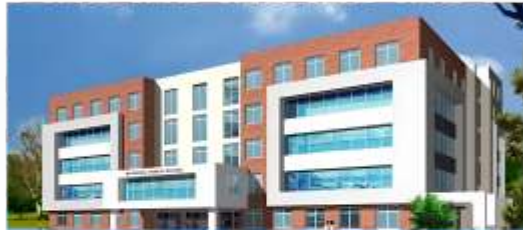
NPS, HSR Layout, Bangalore