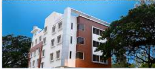
NPS Global Montessori Center